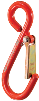
Tipo G1 G1 Type